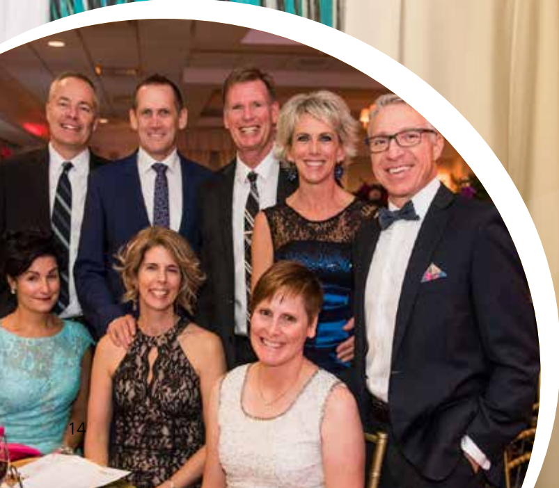
Guests from Saskatchewan Blue Cross at the Mistletoe Charity Ball presented by Potashcorp (Nutrien)

You also helped the Foundation provide $80,000 to the Saskatoon Health Region Professional Development Fund, which supports staff and physicians in all three Saskatoon hospitals.