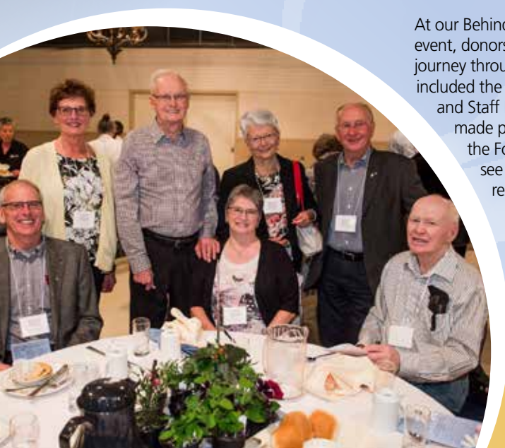
Guests at the Annual Donor Appreciation Luncheon